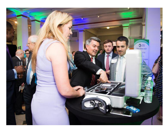
Sen. Gardner (R-CO) with the Security Suitcase at ITI Tech Showcase