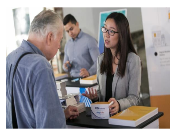
Atlantic Commerce<sup>2</sup> Visa Checkout Demonstration