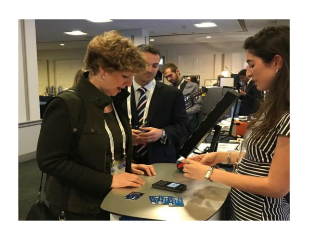
Rep. Brooks (R-IN) demos a biometric card at CES on the Hill