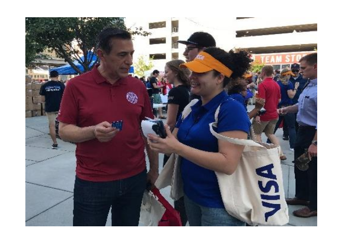
Former Rep. Issa (R-CA) receiving Visa Contactless Demo at Congressional Baseball Game

What If? We could create our own, extended innovation experience for policymakers to demonstrate Visa's role in shaping the digital transformation of commerce