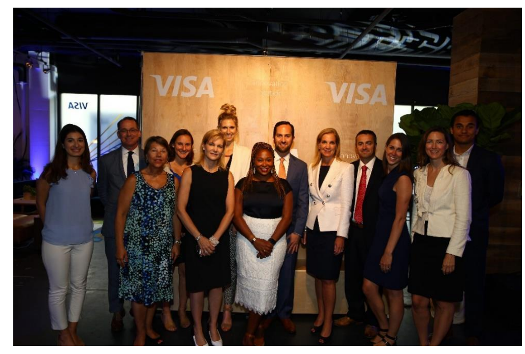
Team Visa at the Innovation Activation