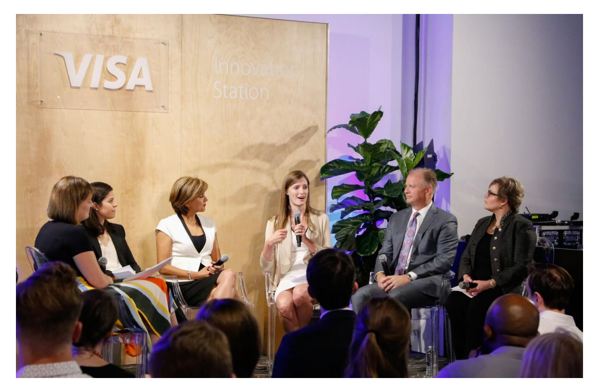
In partnership with TechNet, a conversation about women in technology, "Women are Key to Regaining America's Innovative Edge"