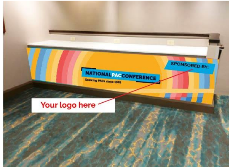
Figure 1 Graphics subject to change; this image is for example purposes only.

Help keep attendees connected at the conference. Sponsorship includes a standing charging station for attendees to charge their devices with electrical outlets provided by the Council. Your company logo will be included on a Council designed wall display on the area shown in the example photo. Sponsors are also welcome to provide items to enhance the area provided that they do not block the chargers.