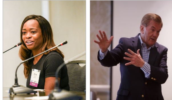
EUROPEAN MEMBERSHIP ORIENTATION