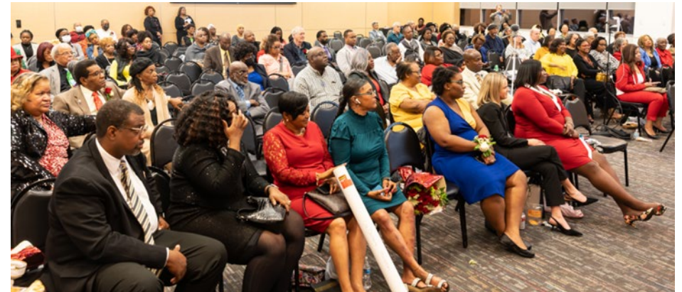
AARP Memphis/National Civil Rights Museum Partnership