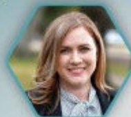
Rep. Lizzie Fletcher