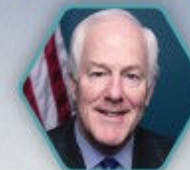
Sen. John Cornyn

She serves on the House Energy and Commerce Committee, and the House Science, Space, and Technology Committee (Environment Subcommittee).