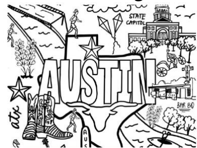
Custom Coloring Wall