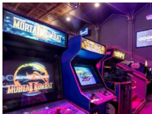
Classic Arcade Games