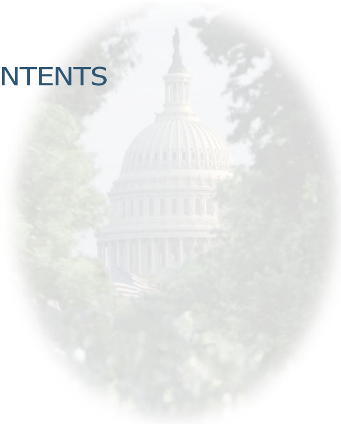
TABLE OF CONTENTS PG. 1 | FAQs PG. 3 | BOARD OF DIRECTORS PG. 3 | FINANCIAL SUMMARY PG. 5 | DISBURSEMENTS PG. 7 | DISBURSEMENT METRICS PG. 12 | POLITICAL COMPLIANCE PG. 14