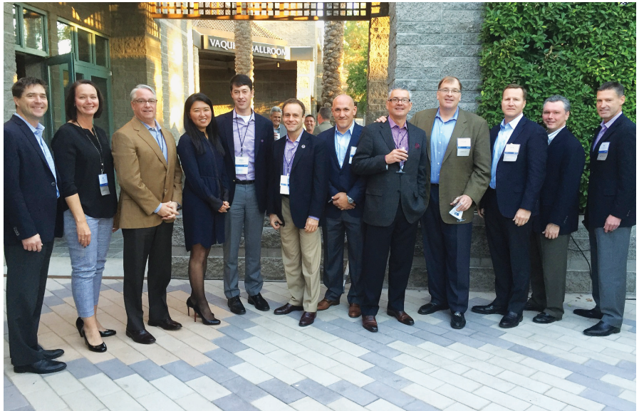
McKesson PAC Board members at ILEAD 2015.