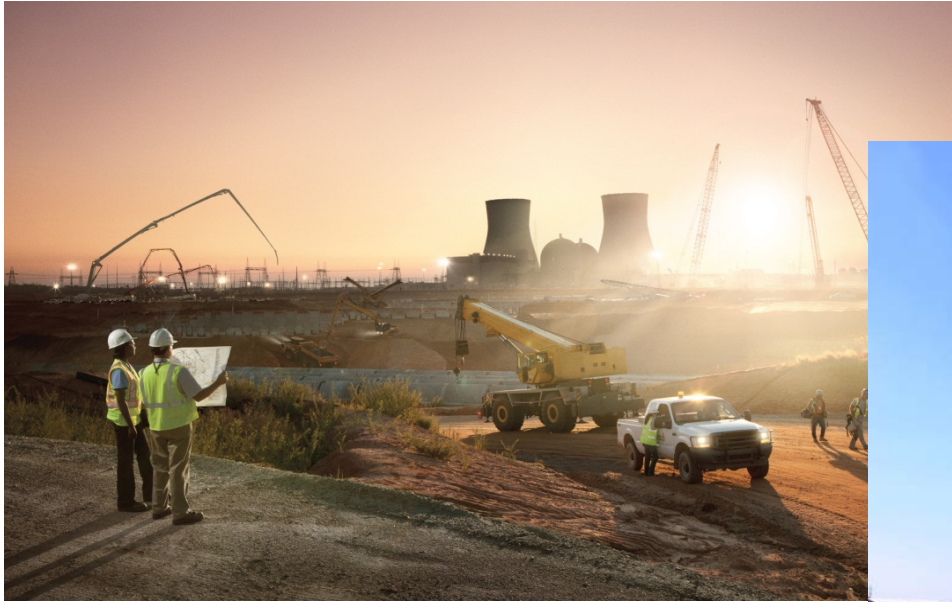
Vogtle 3 & 4