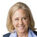
Mary Landrieu Former U.S. Senator (D-LA) Senior Policy Advisor VanNess Feldman