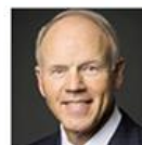
Don Nickles Former U.S. Senator (R-OK) Chairman & CEO The Don Nickles Group