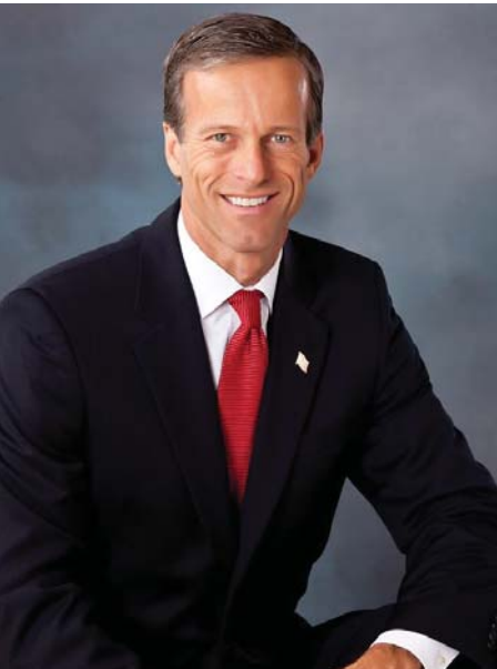
U.S. SENATE John Thune

Endorsements are current as of mailing date.