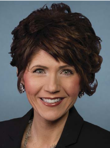
U.S. HOUSE SD-At Large Kristi Noem