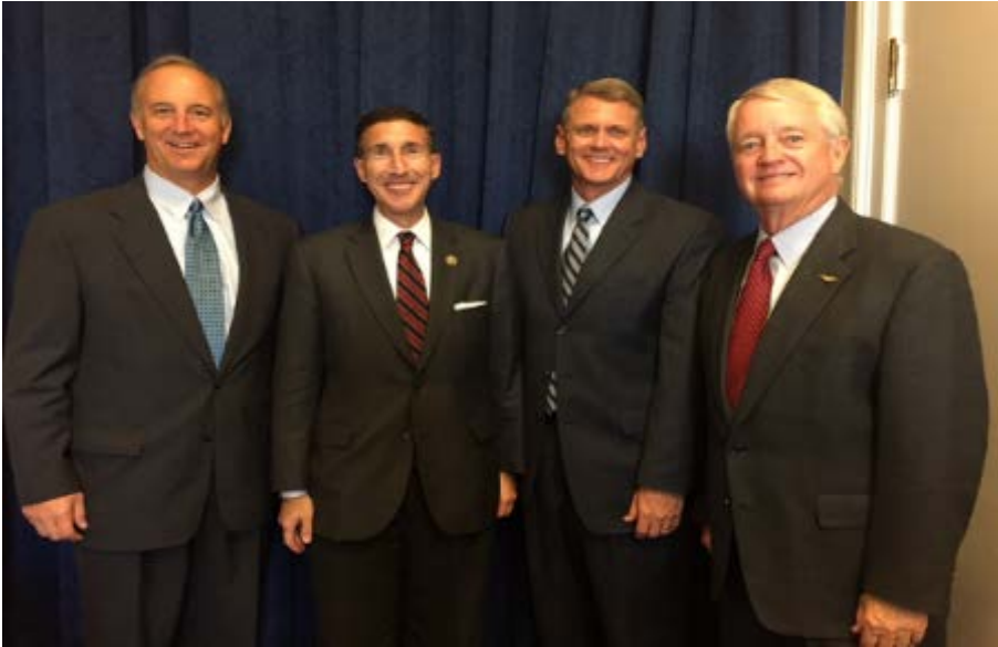
Partnering with customers on public policy initiatives - Envelope Manufacturers Fly-In