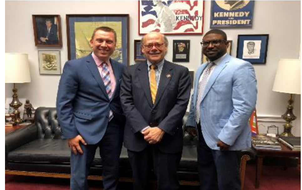
Building internal stakeholder engagement with elected officials – PAC Board Day on the Hill